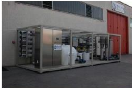
BRACKISH WATER REVERSE OSMOSIS